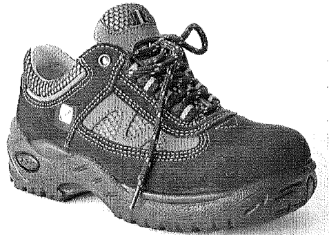
Jalas 3468v LIGHT SPORT