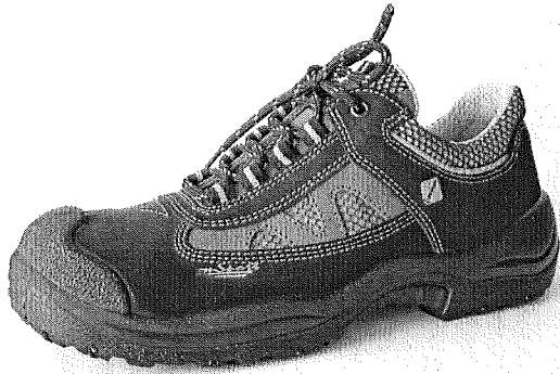
Jalas 3468a LIGHT SPORT